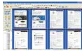
The AVScan X main screen

The Intelligent Document Management Tool