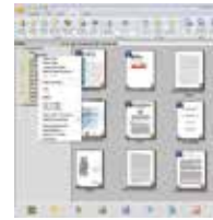
The PaperPort SE14 main screen

The Professional Choice to Organize and Share Your Documents