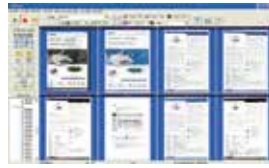
The AVScan X main screen

The Intelligent Document Management Tool