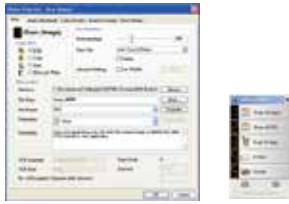
The Button Manager V2 main screen

Button Manager V2 makes it easy for you to scan and send your image to your favorite destinations with a press one button. Now the new version comes with an innovative feature to let you scan and automatically upload the scanned document to popular cloud repositories such as Google Docs, Microsoft SharePoint or FTP. In addition, the iScan feature allows you to insert the scanned image or recognized text after optional OCR (Optical Character Recognition) process to your text editor such as Microsoft Word to get your job done easily and quickly.